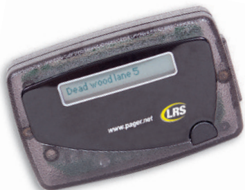
Rechargeable Alphanumeric Pager